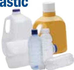
Plastic Jugs/Bottles/Household Plastic Empty containers only