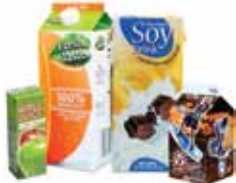
Food & Beverage Containers Empty containers only