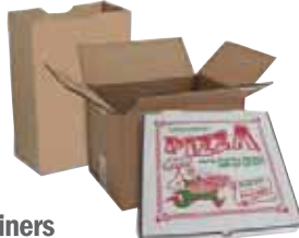
Cardboard, Pizza Boxes & Paper Bags Flatten cardboard & cut into pieces. Remove wax paper from pizza boxes