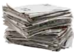
Newspaper Remove bags, strings & rubber bands