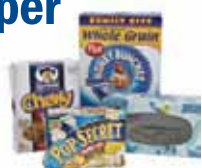
Paperboard All types & sizes