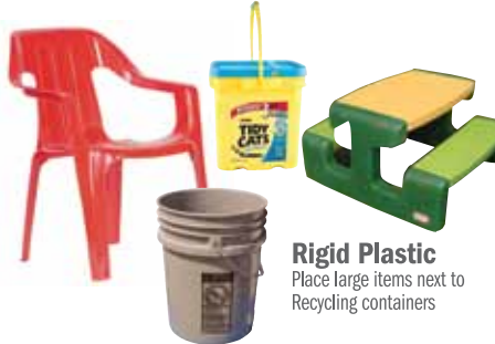
Rigid Plastic Place large items next to Recycling containers