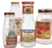
Empty & Clear Bottles & Jars Only