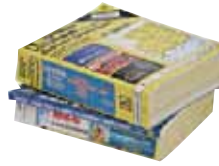
Phone Books All types & sizes