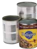
Steel & Tin Cans Empty cans only